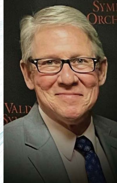
Chairman, Valdosta Symphony Orchestra Board

Without the sale of season tickets and the financial backing of our patrons and sponsors, this would not be possible. We invite you to take part in this ongoing musical endeavor by becoming a subscriber, patron, or corporate sponsor. Please consider joining us at some level of support. If you are already supporting the symphony, why not increase that patronage to the next level? The rewards are great, including the knowledge that you are helping make possible the experience of live classical music here in Valdosta. Learn more about how you may become involved financially with the continued success of the Valdosta Symphony Orchestra.